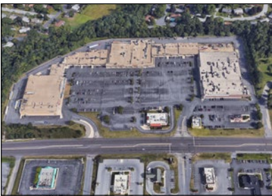
DAUPHIN PLAZA HARRISBURG, PA