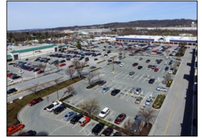
YORK MARKETPLACE EAST YORK, PA