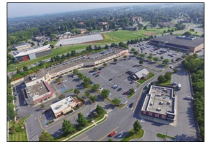
SHOPS AT CEDAR POINT ALLENTOWN, PA