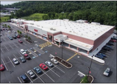
EPHRATA MARKETPLACE EPHRATA, PA