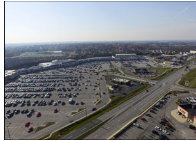
HANOVER CROSSING HANOVER, PA