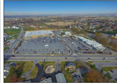
COVERED BRIDGE MARKETPLACE LANCASTER, PA