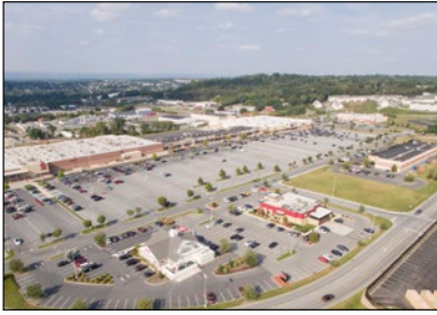
HIGH POINTE COMMONS HARRISBURG, PA