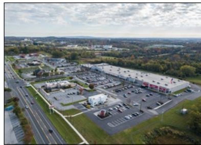
MARSHALL'S PLAZA GETTYSBURG, PA