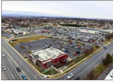
WAYNE PLAZA CHAMBERSBURG, PA