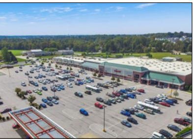
EAST MANCHESTER VILLAGE CENTRE MANCHESTER, PA