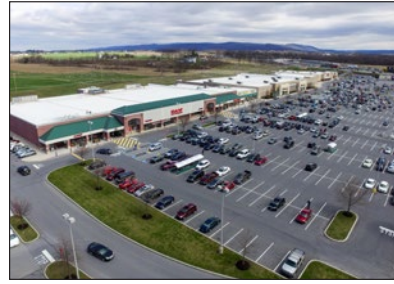
CHAMBERSBURG CROSSING CHAMBERSBURG, PA