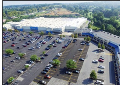
WEST VALLEY MARKETPLACE ALLENTOWN, PA