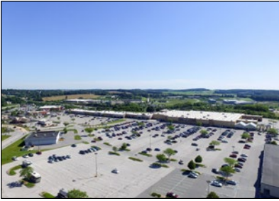
SHREWSBURY COMMONS SHREWSBURY, PA