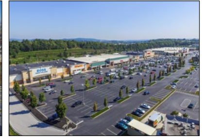
DELCO PLAZA YORK, PA