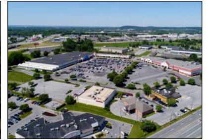
HAWTHORNE CENTRE LANCASTER, PA