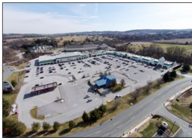
SOUTH YORK PLAZA YORK, PA