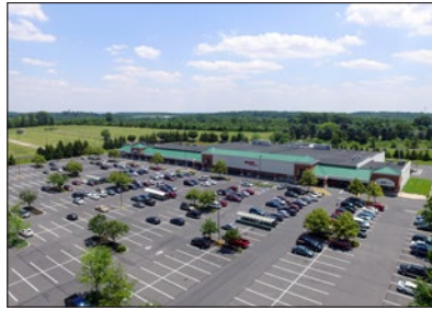
GETTYSBURG MARKETPLACE GETTYSBURG, PA