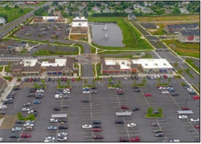
MADISON FARMS EASTON, PA