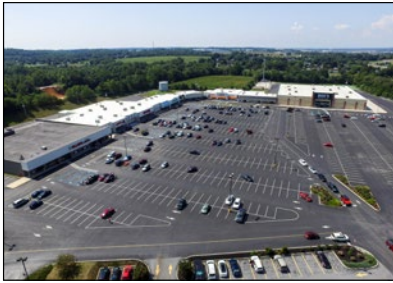
FRANKLIN CENTER CHAMBERSBURG, PA