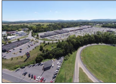
CARLISLE CROSSING CARLISLE, PA