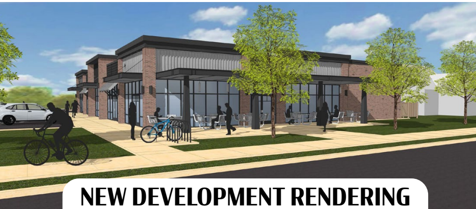
NEW DEVELOPMENT RENDERING