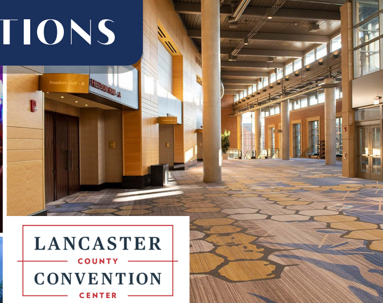
LANCASTER COUNTY CONVENTION CENTER