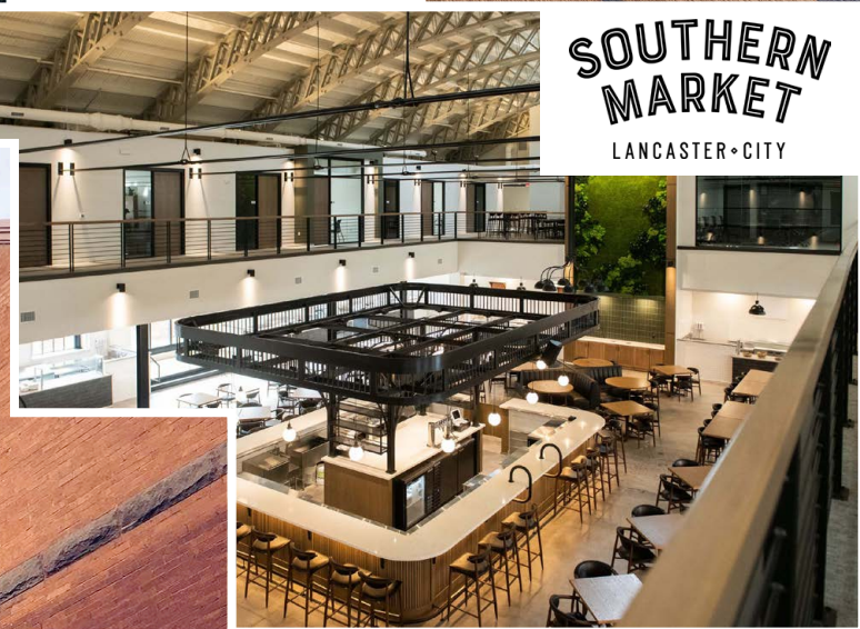
SOUTHERN MARKET LANCASTER • CITY