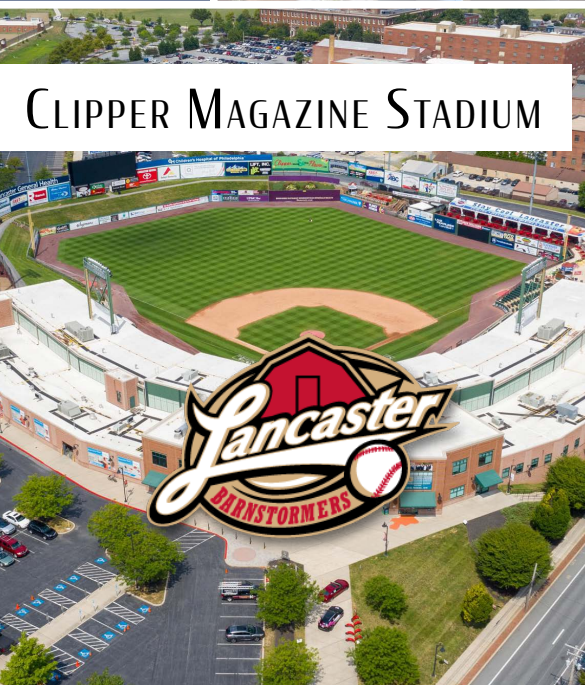
CLIPPER MAGAZINE STADIUM