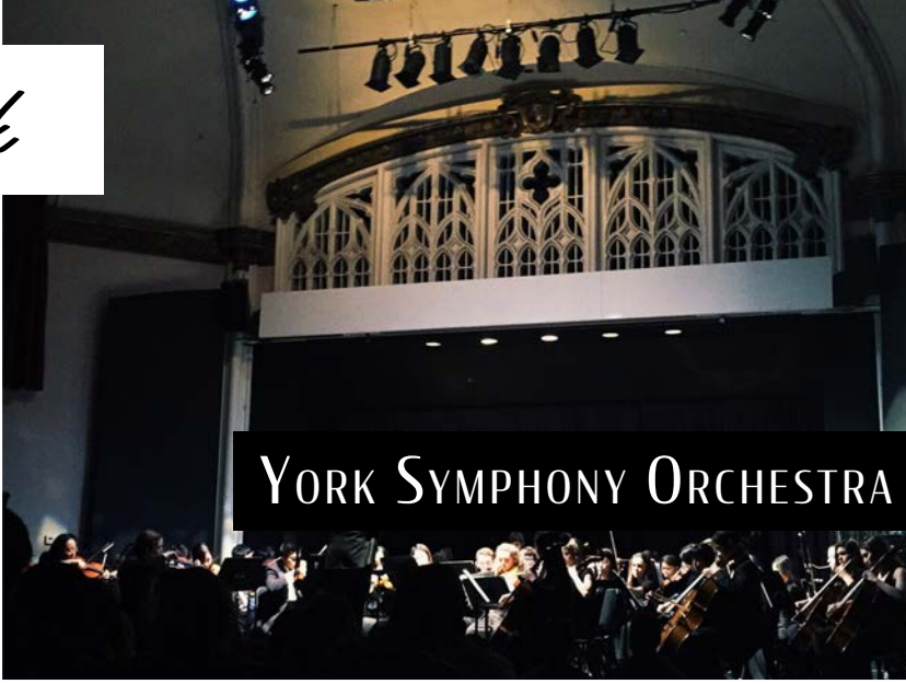
YORK SYMPHONY ORCHESTRA