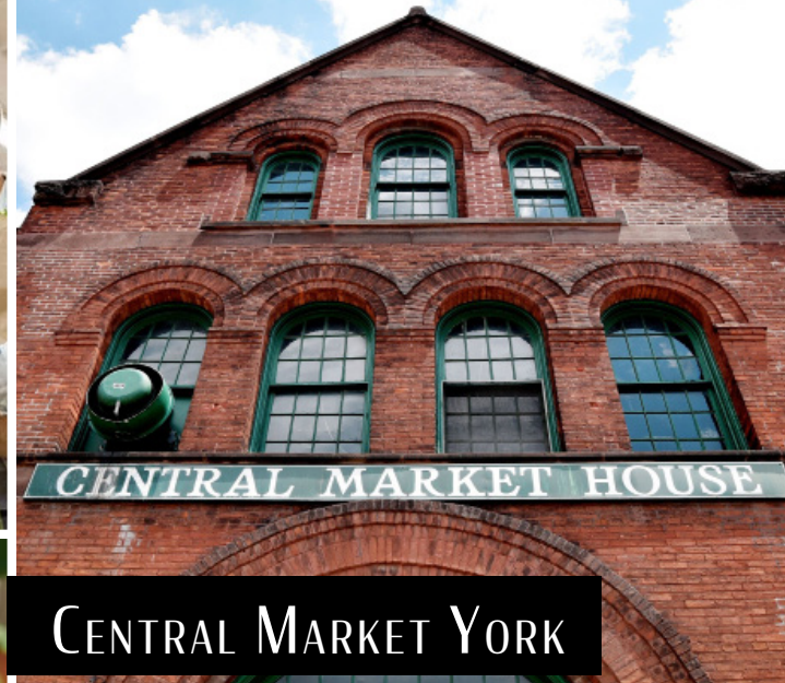
CENTRAL MARKET HOUSE