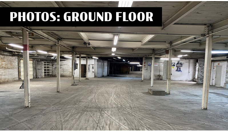
PHOTOS: GROUND FLOOR