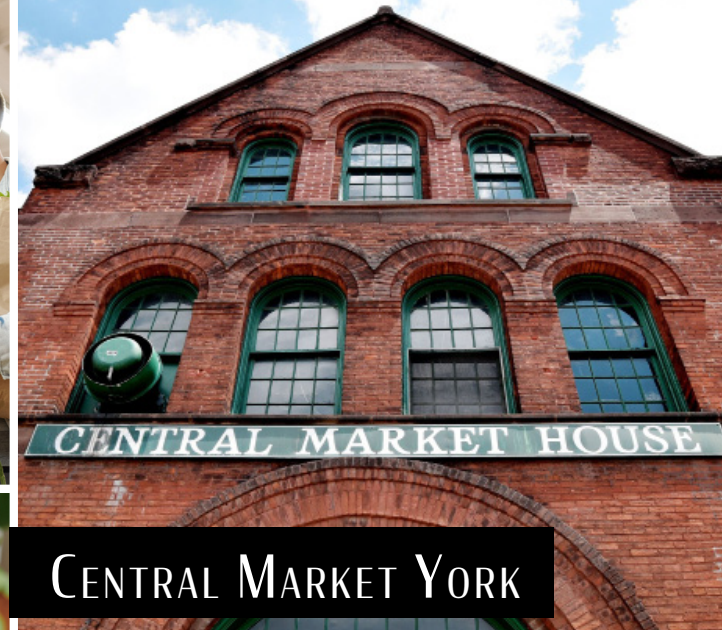
CENTRAL MARKET YORK