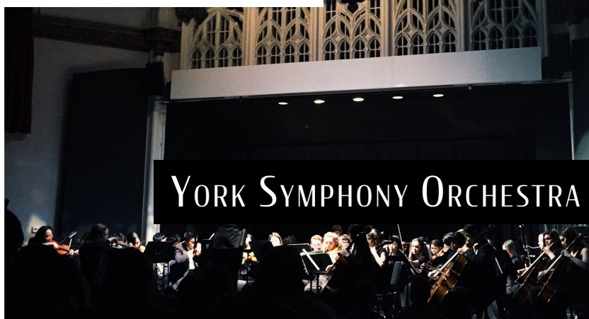
YORK SYMPHONY ORCHESTRA