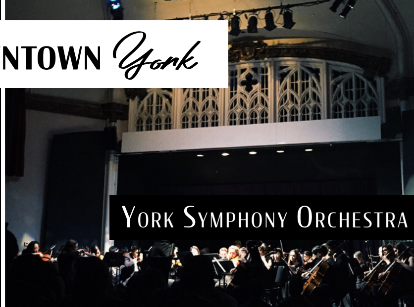
YORK SYMPHONY ORCHESTRA