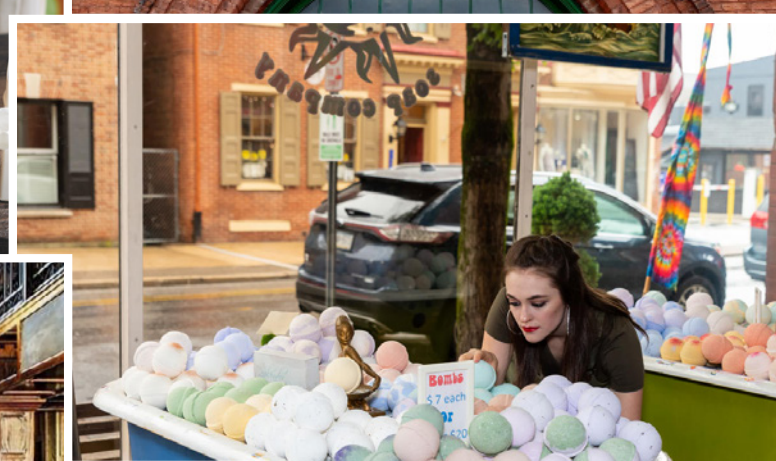
SUNRISE SOAP CO.