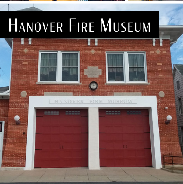
HANOVER FIRE MUSEUM