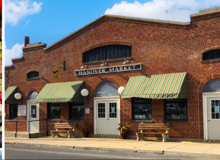
HANOVER MARKET HOUSE