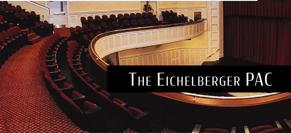
THE EICHELBERGER PAC