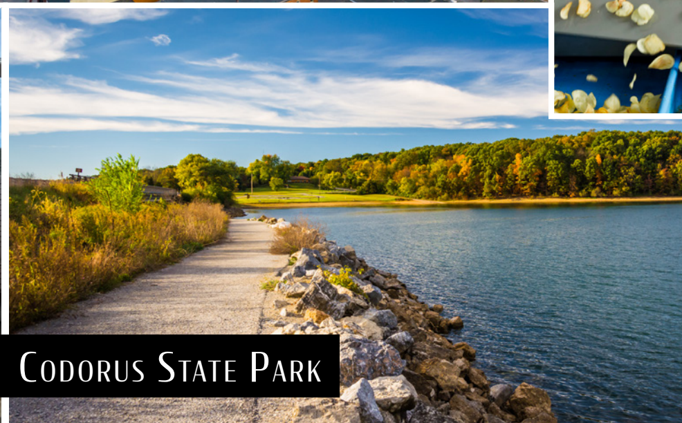
CODORUS STATE PARK