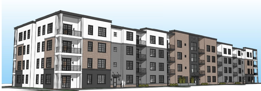
FRONT PERSPECTIVE SCALE: