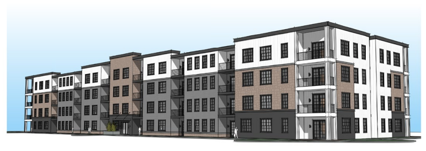
BACK PERSPECTIVE SCALE: