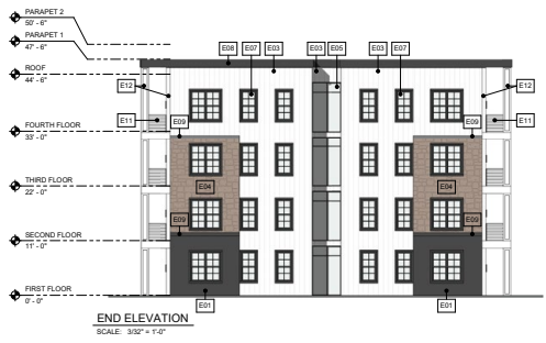
END ELEVATION SCALE: 3/32" = 1'-0"