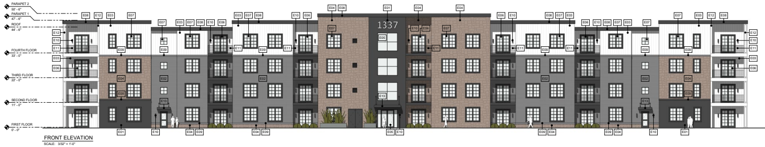
FRONT ELEVATION SCALE: 3/32" = 1'-0"