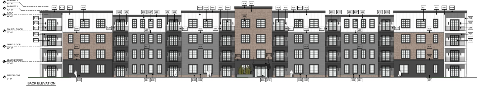
BACK ELEVATION SCALE: 3/32" = 1'-0"