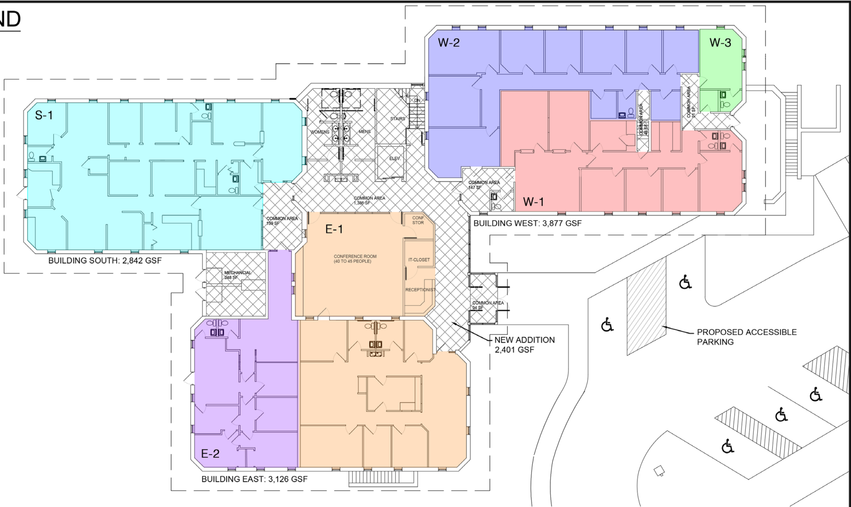
UPPER LEVEL FLOOR PLAN - PHASE 1