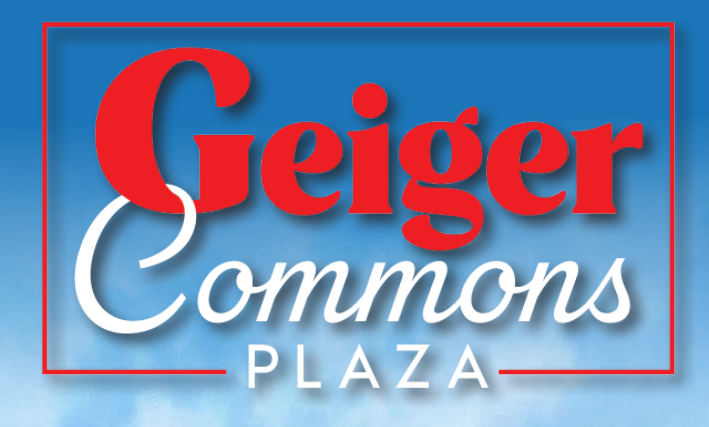
553 EAST 3<sup>RD</sup> STREET | WILLIAMSPORT, PA | 17701