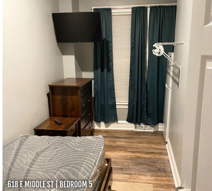
618 E MIDDLE ST | BEDROOM 5