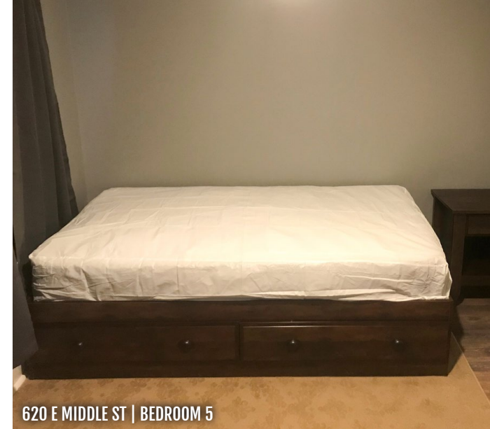
620 E MIDDLE ST | BEDROOM 5