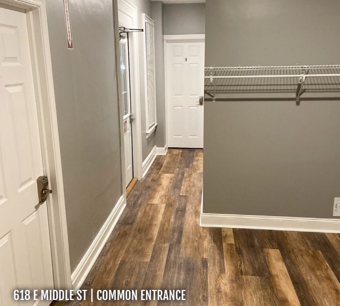
618 E MIDDLE ST | COMMON ENTRANCE