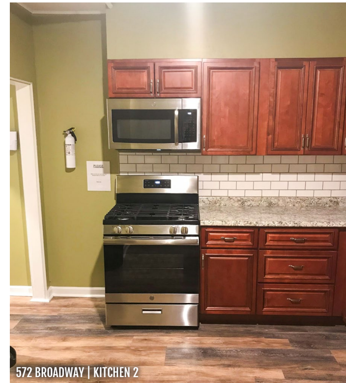
572 BROADWAY | KITCHEN 2

The properties are located in the Borough of Hanover. Surrounding uses include employers such as UPMC, RH Sheppard, Hanover Foods, Campbell's, Hanover School District. The primary retail area in north Hanover is approximately one mile north of these buildings. Public transportation is nearby. Hanover is located in York County, which is south central Pennsylvania. The town is anchored by strong employers and retail on the north side of town. The south side has experienced residential growth due to the proximity of the location near the PA/MD state line.