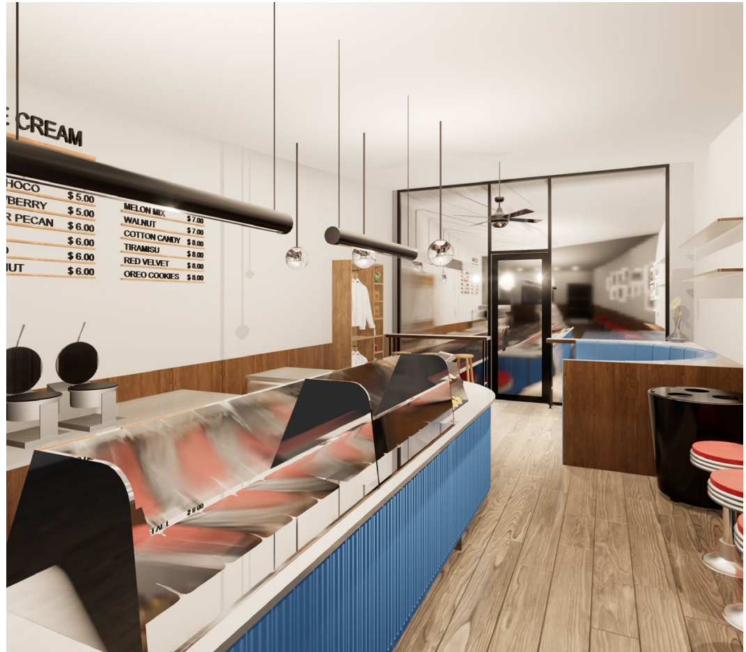
*Photos are conceptual drawings for viewing purposes